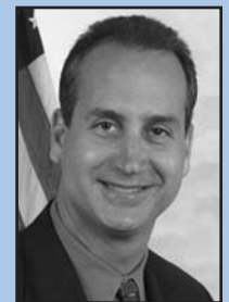
U.S. Rep. Dist. 25 Mario Diaz-Balart