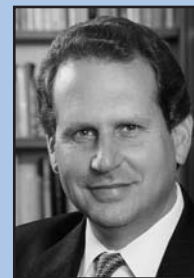
U.S. Rep. Dist. 21 Lincoln Diaz-Balart