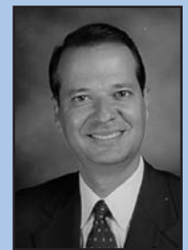
State Senator Alex Villalobos