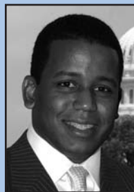
U.S. Rep. Dist. 17 Kendrick Meek