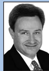
Commissioner of Agriculture Eric Copeland