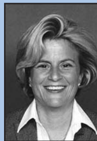
U.S. Rep. Dist. 18 Ileana Ros-Lehtinen